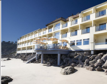
HRL-Negotiated rates as of 3/16/2022